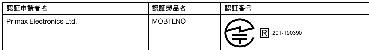
Table 1. 無線

本製品は、電波法により技術基準認証を下記のとおり取得しています。分解や改造を行うことは電波法の規定により認められていません。